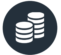
Constraints to public finances