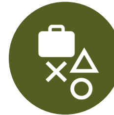
Inflation and cost of living crisis