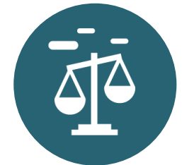
Poverty and inequality